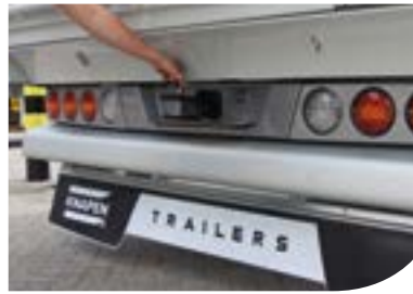
Strong, central towing eye