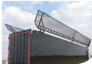
Hydraulic folding roof