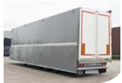
Side wall protection sheet