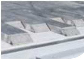
10 mm aluminium

Since 1984, we have focussed on continually improving a single product: the moving floor trailer. This type of trailer has proven to be an ideal and versatile form of transport in many sectors, including waste transport. We call our latest generation NEXT . This generation of trailers is full robot-welded, has been intensively trialled and is based on more than 34 years of experience. This allows us to guarantee our customers years of problem-free operation, the lowest total operational costs and the highest residual value. By pushing the boundaries, we have created an advantage in our branch for more than 34 years. We are proud of this and our customers can hold us to account about it.