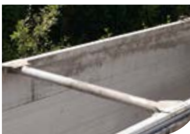
Heavy-duty bar construction