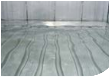
(Semi) Leak proof