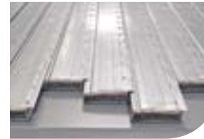
Flat Steel X Floor