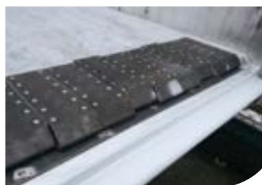
Harbox protective plates