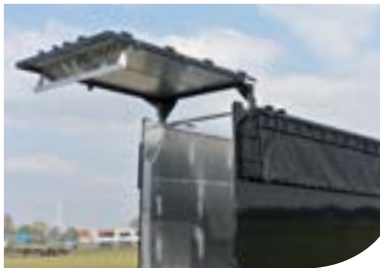
Hydraulic tailgate (integrated doors optional)