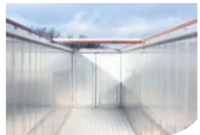
Steel top edge construction with single bar