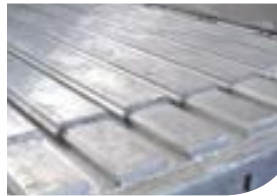
(Semi) Leak proof