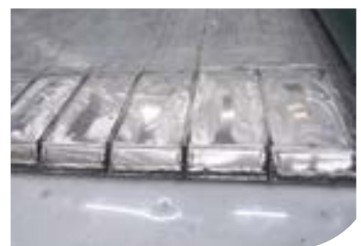
Aluminium protective plates