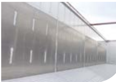
Wear plates in many types and sizes